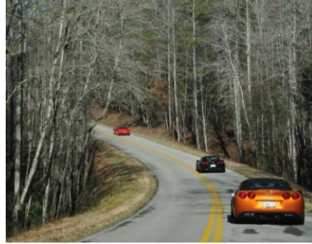
It was a beautiful afternoon for the cruise.

If you missed Tuesday's meeting you missed the 48 other pictures.