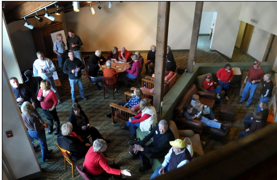
Saturday afternoon at Unicoi was a time for visiting with old friends and making new ones.