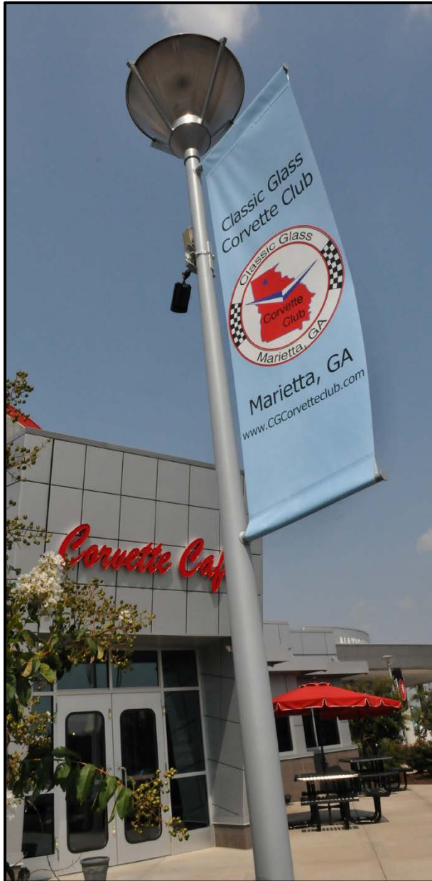
Our new club banner is now strategically hung just outside the entrance to the Corvette Cafe at the NCM.

A Monthly Publication for the Members of The Classic Glass Corvette Club Volume XXI Issue 10 October 2011