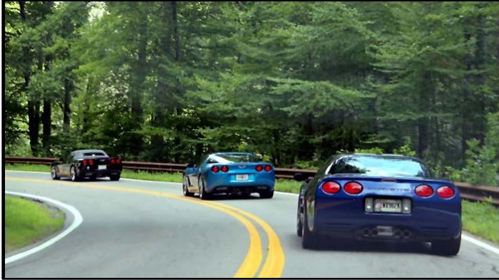
Running twisting mountain roads with friends always makes for a good day, and this one was no exception.