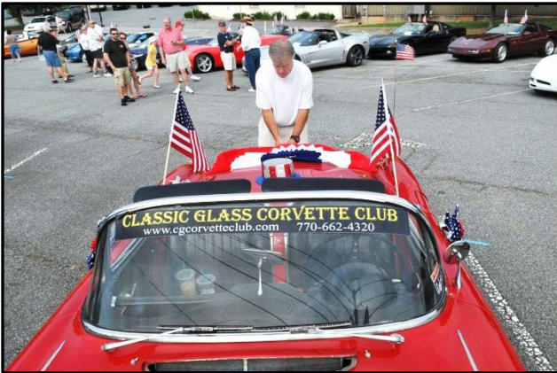
CGCC windshield cling installed and almost ready to go.