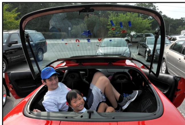
This has to be a fun way to ride in a parade and throw candy!